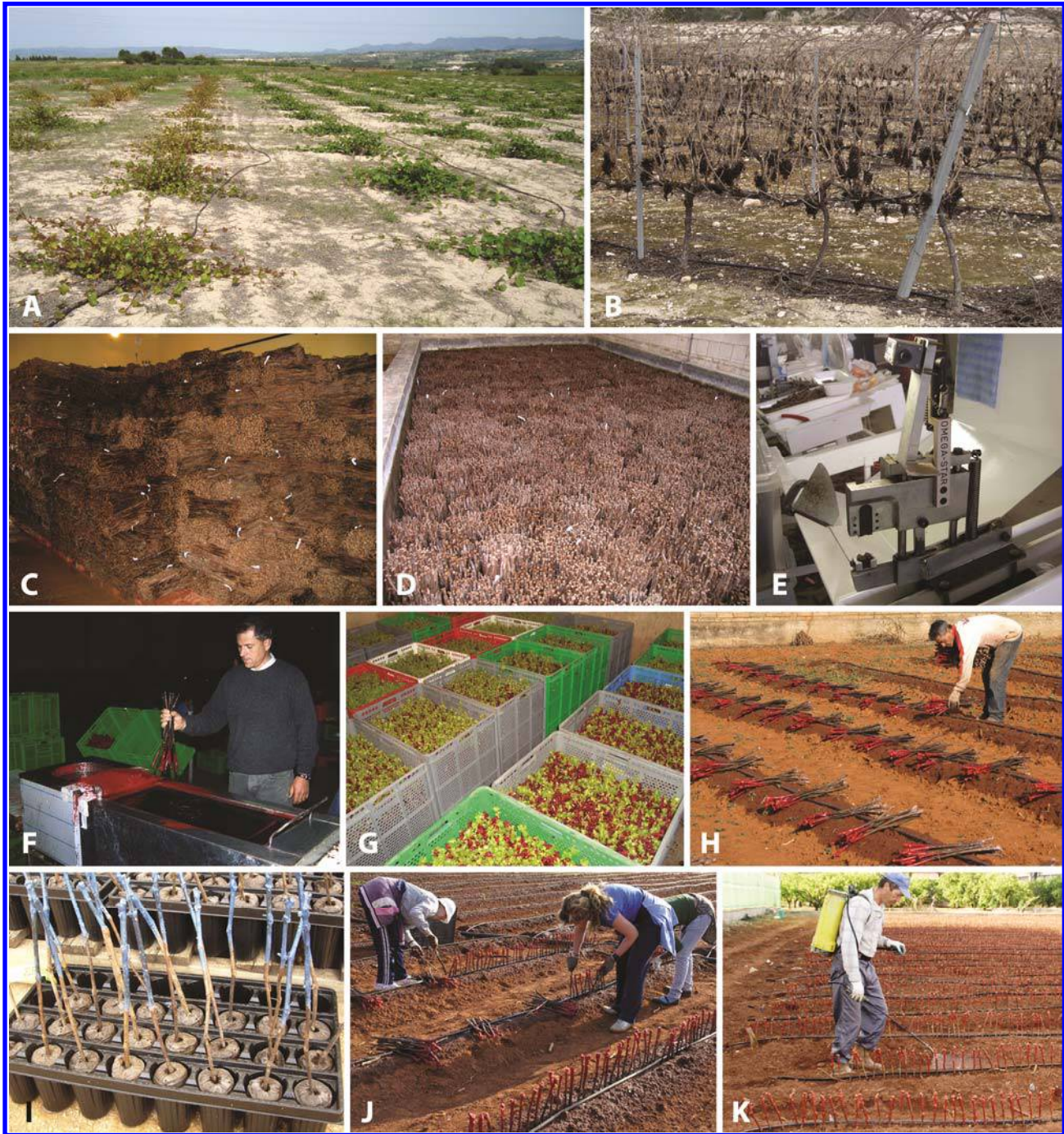
Fig. 3. A, Grapevine rootstock mother plants in early stages of development. B, Grapevine scion mother plants. C, Grapevine cuttings in cold storage. D, Cuttings being soaked in water tanks. E, Omega-cut grafting machine. F, Graft unions being dipped in a melted wax formulation. G, Grafted vines under growth-stimulating, warm and humid callusing conditions. H, Vines planted in an open-root field nursery. I, Vines planted into pots. J, Cuttings pushed into the soil by hand leaving at least two nodes exposed. K, Control treatments of weeds using herbicides at pre-emergence.

fied chambers for 2 to 3 weeks depending on the temperature and the variety (92,138,229). The temperature, humidity, and callusing medium may vary between nurseries. For example, in Italian nurseries, plants are put in forcing boxes filled with wood shavings and maintained at 30 to 32°C with 75 to 90% relative humidity (RH) for about 2 weeks (230). In South Africa, hand-grafted cuttings are cold-callused at circa 18°C for a period up to 5 weeks, while machine-grafted cuttings are hot-callused at 26 to 28°C and 70% RH for a period of up to 3 weeks followed by a hardening off period of 1 to 2 weeks under shade netting (62). The callusing medium used in South Africa consists of fresh pine sawdust drenched in a broad-spectrum fungicide (164). In Spain, grafted plants are placed in plastic boxes with a 10-cm peat bed and stored at 24 to 26°C and 80% RH for 16 to 20 days (13,92). Australian