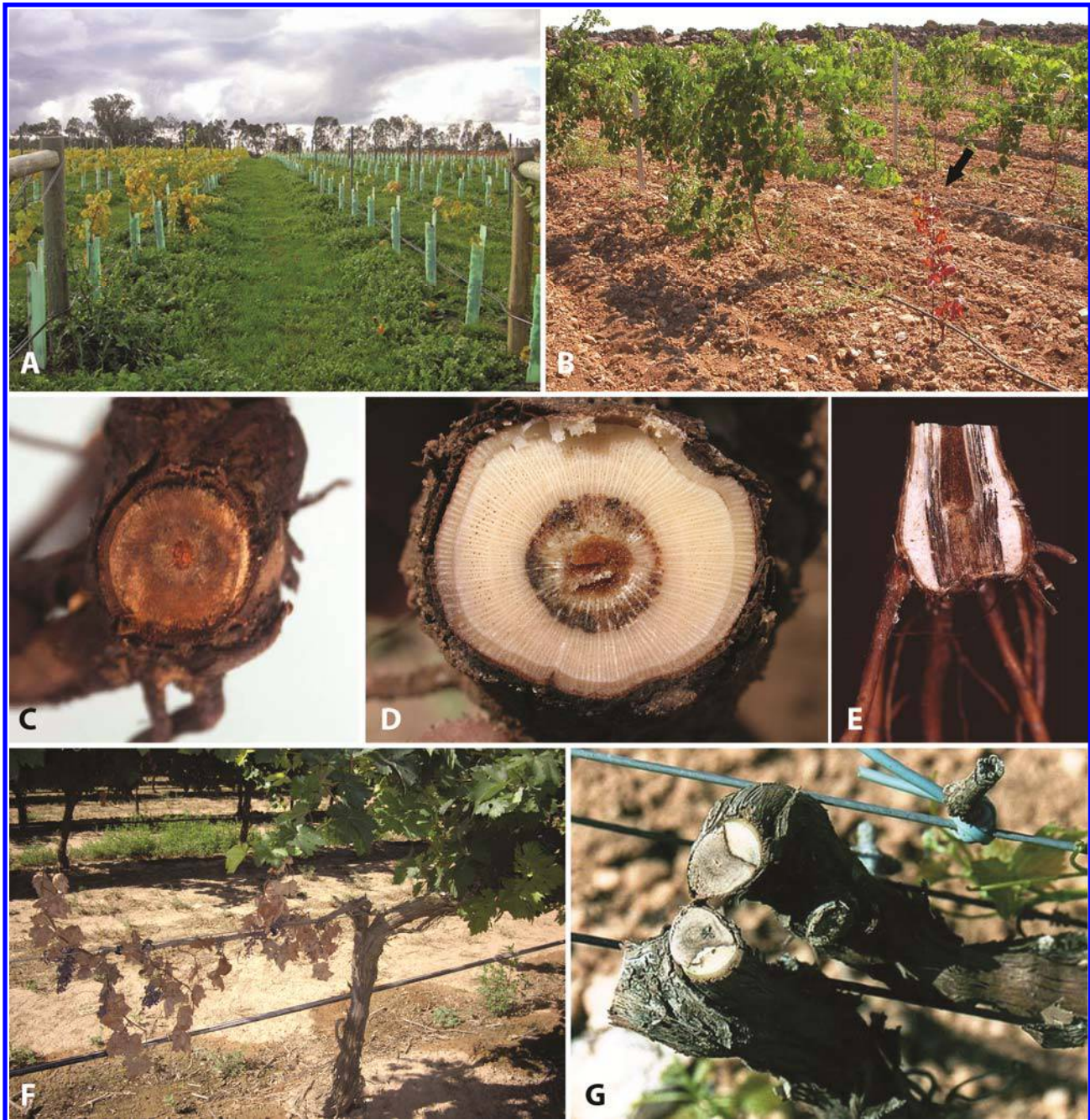
Fig. 1. A , Growth of good and poor quality young vines from the same nursery. Affected plants show stunted growth, reduced vigor, and retarded sprouting. B , Symptoms of severe leaf wilting and dieback (plant indicated by arrow). C , Black discoloration and necrosis of grape tissue which develops from the base of the rootstock characteristic of black-foot disease. D , Rootstock cross section showing a ring of necrotic xylem vessels surrounding the pith, characteristic of Petri disease. E , rootstock longitudinal section showing dark brown to black streaking of the xylem tissues. F , Dead arm affected by Botryosphaeriaceae species. G , Cross section showing a wedge-shaped necrosis caused by Botryosphaeriaceae species.

Additionally, species of the family Botryosphaeriaceae have been frequently isolated from declining young vineyards in different grapevine-growing areas worldwide (66,70,80,119,140, 151,202). To date, 17 different members of the Botryosphaeriaceae, placed in the anamorphic genera Diplodia , Dothiorella ,