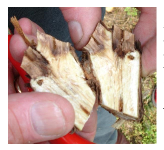
Figure 3 - Cross section of vine showing fungal infection entry point in pruning wound (Newsome J, 2011b)

Generally, the infection vectors and disease cycle for the pathogenic species of fungi identified above are all similar. The fungi overwinter in diseased wood and develop fruiting bodies during high humidity periods. Spores are released by rainfall and spread by rain splashes and wind (Ayres et al. 2011; Mundy & Manning 2010). It has also been shown that trunk disease fungi can survive for extended periods in soils across a range of temperature and humidity (Tello, Gonzalez & Andres, 2012). During extended rainfall events, spores will be produced for up to 36 hours before fruiting bodies are exhausted and take 12 days to recharge (Sosnowski et al. 2009). Lab-based research has shown that the fungi will produce conidia in the temperature range 6 - 30 °C (Copes & Hendrix 2004) and in the same paper, Copes & Hendrix hypothesise that conidial production may be initiated at less than 6 °C with the release of mature conidia delayed until the temperature rises. However this would need to be demonstrated before it is of practical use as information to influence pruning conditions.