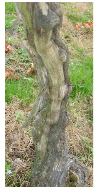
Figure 1 – Visible exterior canker (Newsome J, 2011a