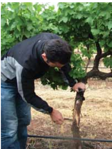
Figure 10 Removing bark on a trunk to identify cankers in a symptomatic grapevine