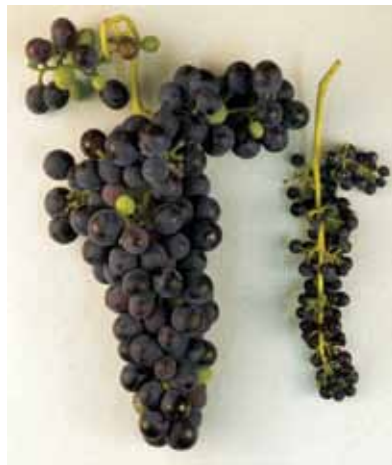
Figure 6 Grape bunches that form on grapevines infected with eutypa dieback are often small (right) and berries ripen unevenly (left).

Toxins are thought to be produced by the fungus in the wood and these are translocated to the foliage, producing the unique foliar symptoms of Eutypa dieback. Cankers form around initial infection points and damage vascular tissue, causing wood necrosis and dieback.