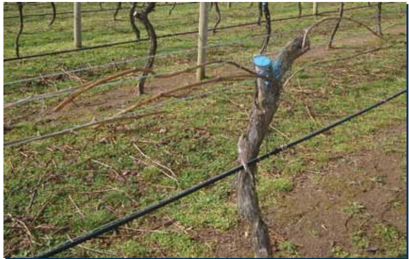
Figure 8 Infected wood has been removed from these grapevines, large cuts painted with protective wound treatment and new shoots trained as replacement cordons.

Apply a paint and/or fungicide (Table 2) to all large cuts.