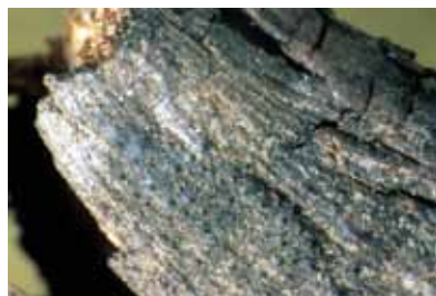
Figure 7 Fruiting bodies on dead, diseased wood with charcoal appearance.