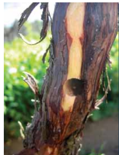
Figure 12 Grapevine trunk with canker showing the sample collection point.