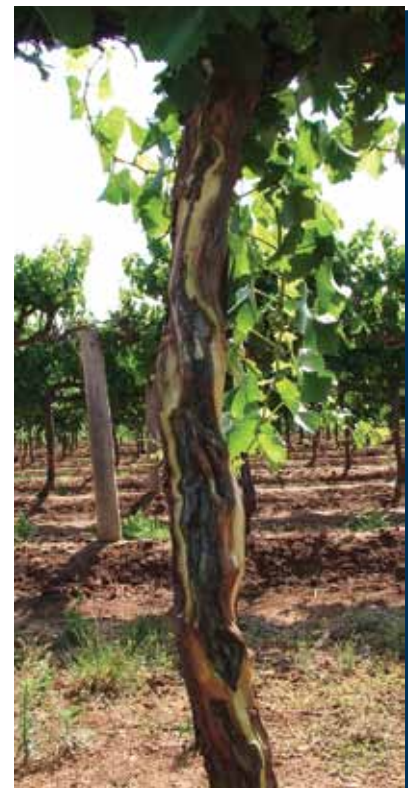
Figure 2 Botryosphaeria dieback in the grapevine trunk.

Eutypa dieback is distinguished from botryosphaeria dieback by the presence of foliar symptoms, but these are not always present. The foliar symptoms are caused by toxins produced by the fungus, resulting in: