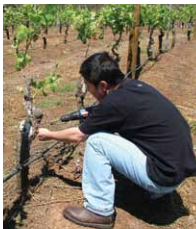
Figure 11 Extracting wood sample from the trunk of a grapevine with a history of botryosphaeria dieback.