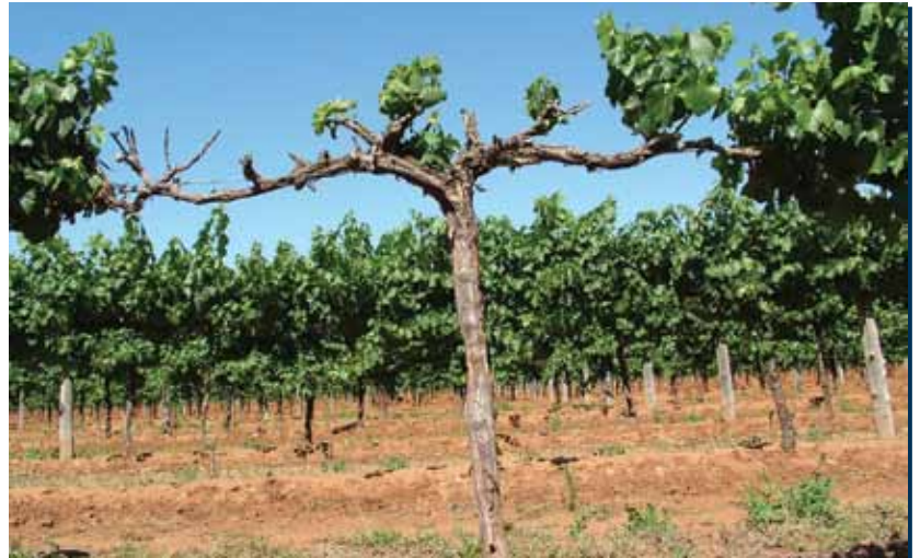
Figure 1 Botryosphaeria dieback causes dead arm or dieback of the cordons and trunk.

Eutypa dieback is caused by the fungus Eutypa lata . E. lata was first described on apricot, and has since become an important pathogen of grapevines in Australia.