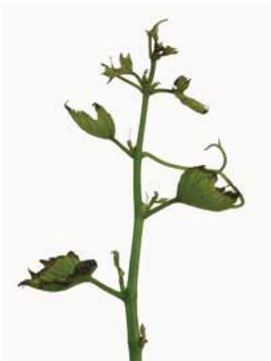
Figure 5 Small cupped leaves with necrotic margins are symptoms of eutypa dieback, not seen in botryosphaeria dieback.