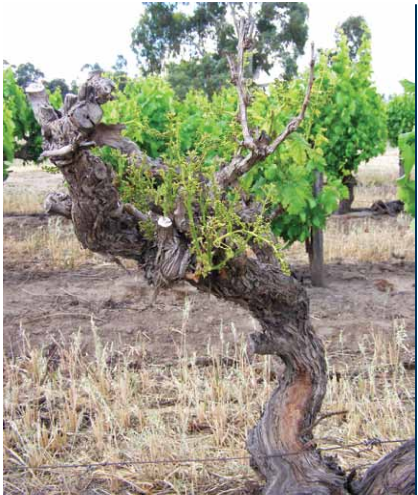
Figure 4 Distorted shoots caused by the eutypa dieback fungus, Eutypa lata .