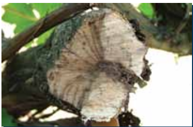
Figure 3 Wedge-shaped canker seen in the cross section of the grapevine trunk typical of botryosphaeria dieback and eutypa dieback.

Additionally, grape bunches may not initiate, and may drop off after flowering or shrivel. Smaller bunch size and uneven berry ripening may also occur (Figure 6). Fungal fruiting bodies on dead wood infected with eutypa dieback have a charcoal appearance (Figure 7).