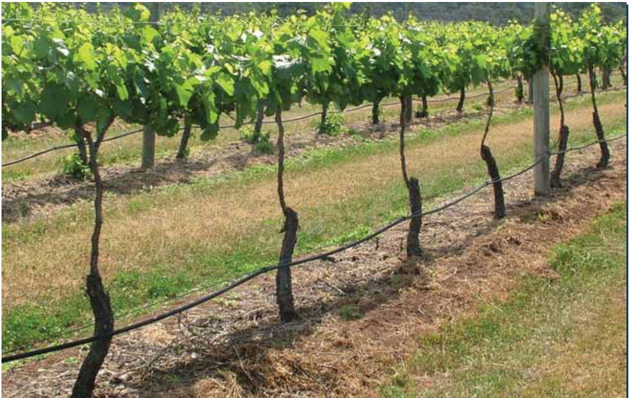
Figure 9 Infected wood has been removed from diseased grapevines and shoots trained to replace trunk and cordons.